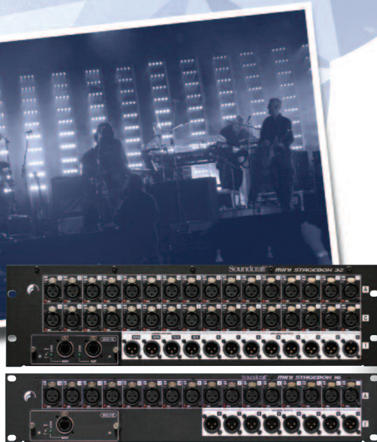
The 3U Mini Stagebox 32 and 2U Mini Stagebox 16 come with interface cards included.