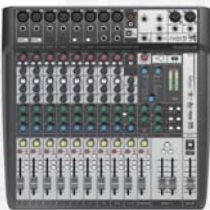
Signature 12 MULTI-TRACK

Also available: Signature Series Multi-track versions with multi-channel ultra-low latency USB audio interface -