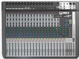
Signature 22 MULTI-TRACK

Soundcraft, Harman International Industries Ltd., Cranborne House, Cranborne Road, Potters Bar, Hertfordshire EN6 3JN, UK T: +44 (0)1707 665000 F: +44 (0)1707 660742 E: soundcraft@harman.com Soundcraft USA, 8500 Balboa Boulevard, Northridge, CA 91329, USA T: +1-818-893-8411 F: +1-818-920-3208 E: soundcraft-usa@harman.com